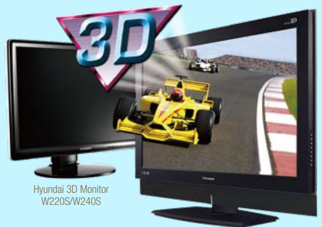
Hyundai 3D Monitor W220S/W240S

In addition to conventional 2D operations HYUNDAI IT's stereoscopic 3D displays make it possible to viewing 3D images with a breathtaking three-dimensional effect. For example, 3D models created with CAD software can be displayed more life like and thus allowing a presentation close to reality. Beside professional applications, Hyundai 3D displays are great for multimedia operation such as 3D games, movies or pictures.