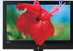
Circular Polarized Glass